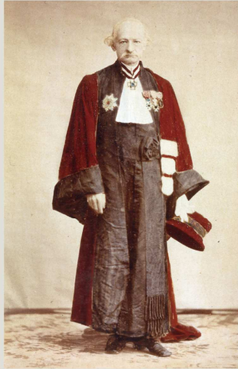
The history of Hosei University originates from the Tokyo Hogakusha (Tokyo School of Law) established in 1880. Satta Masakuni, one of the young founders, Satta's teacher Dr. Gustave Emile Boissonade, and the legal scholar UME Kenjiro laid the foundations for the university.