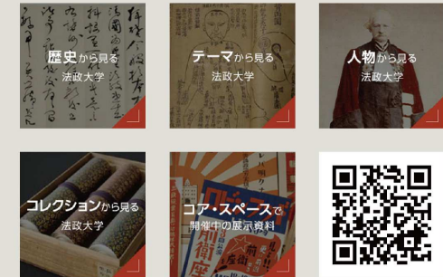
Digital Archives Website

The Digital Archives digitize, compile, and manage valuable materials and collections at Hosei University to preserve them and make them available inside and outside the university.