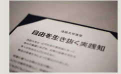
Today, Hosei University is one of the leading universities in Japan. We uphold the spirit of Practical Wisdom for Freedom stipulated in the University Charter as our pledge to society to creatively pursue the ideals of education and research without losing sight of our origins.