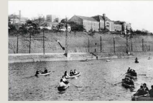
In 1920, Hosei University was promoted from a vocational school to a university. After obtaining university status, the developing university made a new start with teaching staff that included NOGAMI Toyoichiro and other students of NATSUME Soseki, and the philosopher MIKI Kiyoshi.