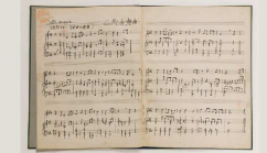
The current Hosei University school song (lyrics by Sato Haruo, music by Konoe Hidemaro) was created on the initiative of students. Here, visitors can listen to the school song and learn about its origins.